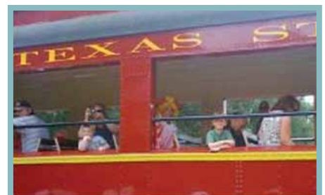
The train pulling into the Palestine RR Park station with it's load of happy children, most had never been on a train