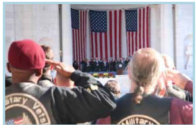
Military Vets salute Vice President Biden at Arlington National Cemetery on Veteran's Day 2010.